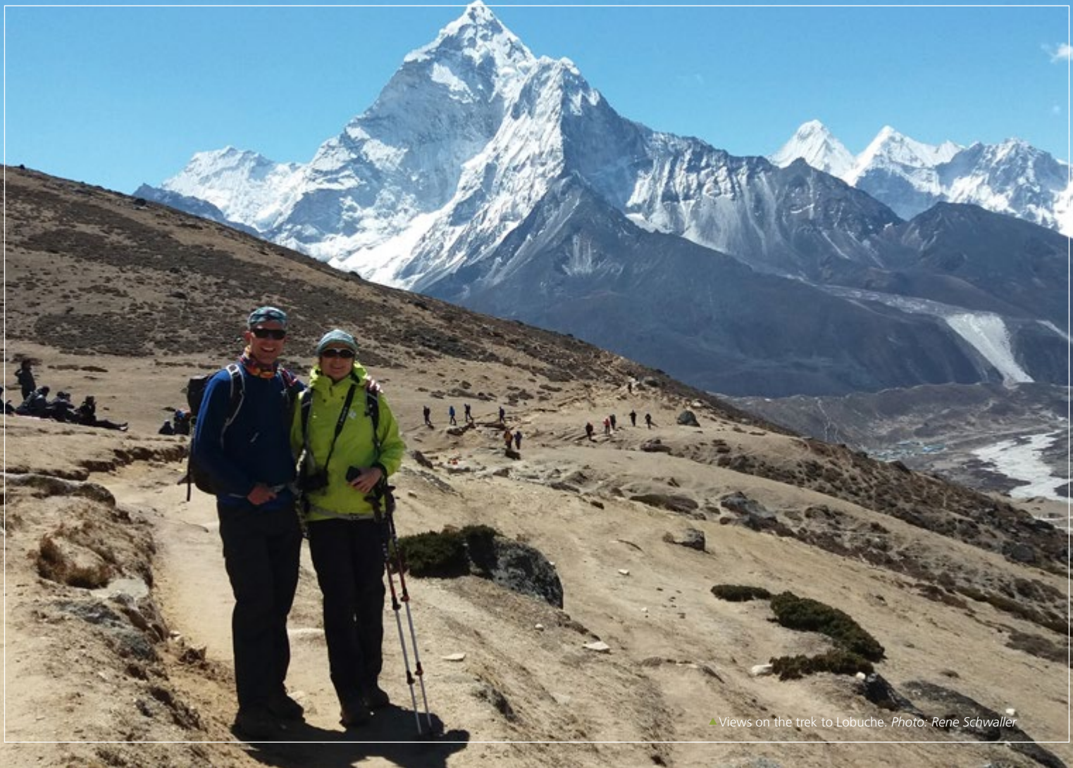
▲ Views on the trek to Lobuche.