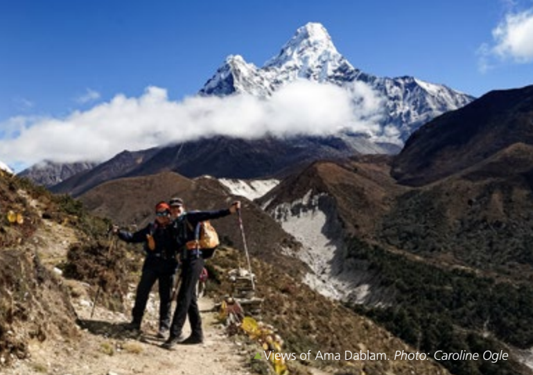
Views of Ama Dablam.