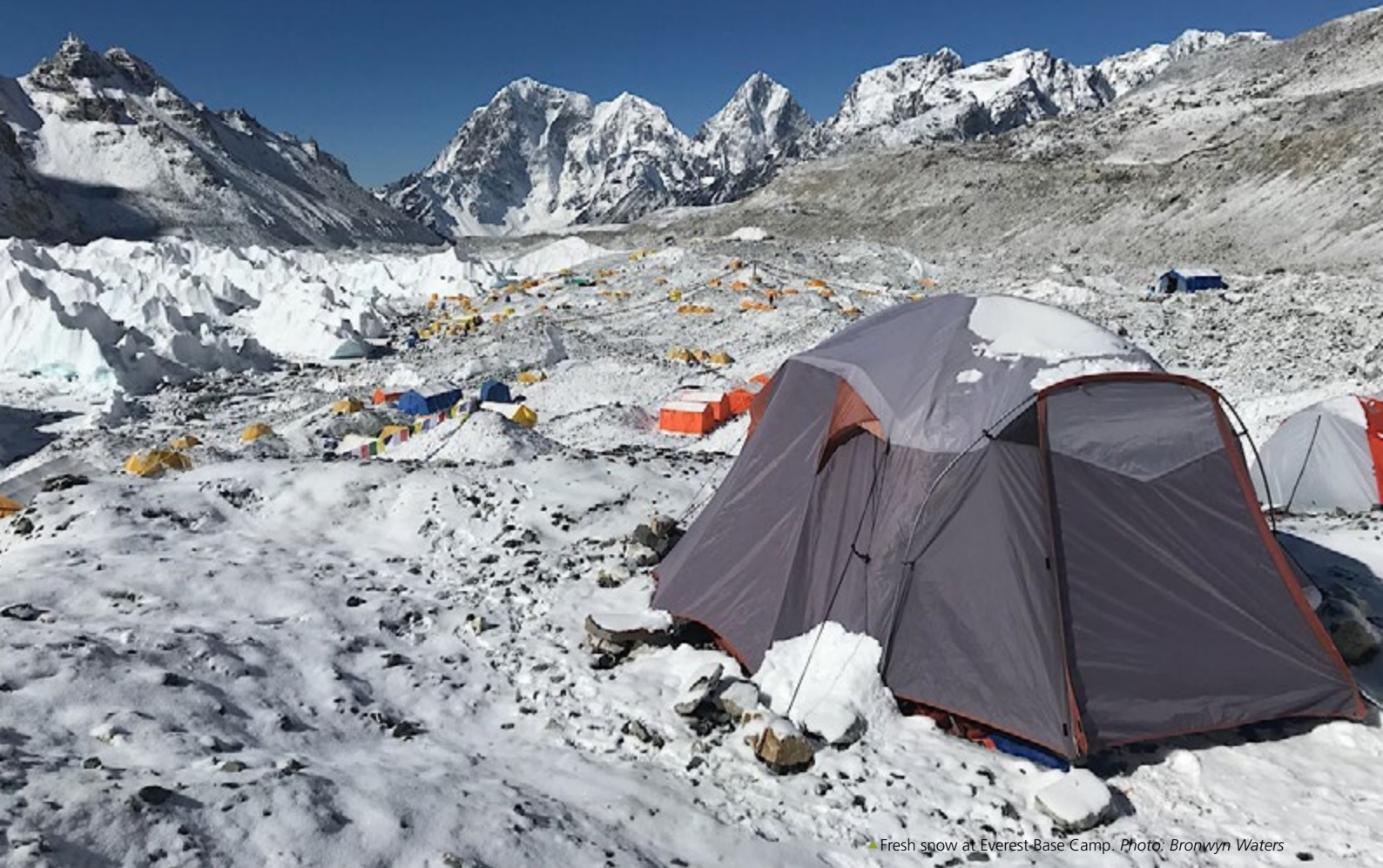
• Fresh snow at Everest-Base Camp.