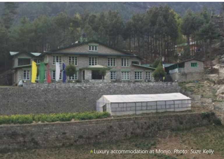
▲ Luxury accommodation at Monjo.