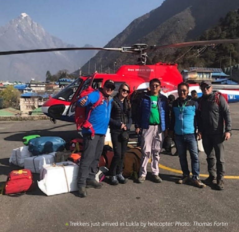
▲ Trekkers just arrived in Lukla by helicopter.