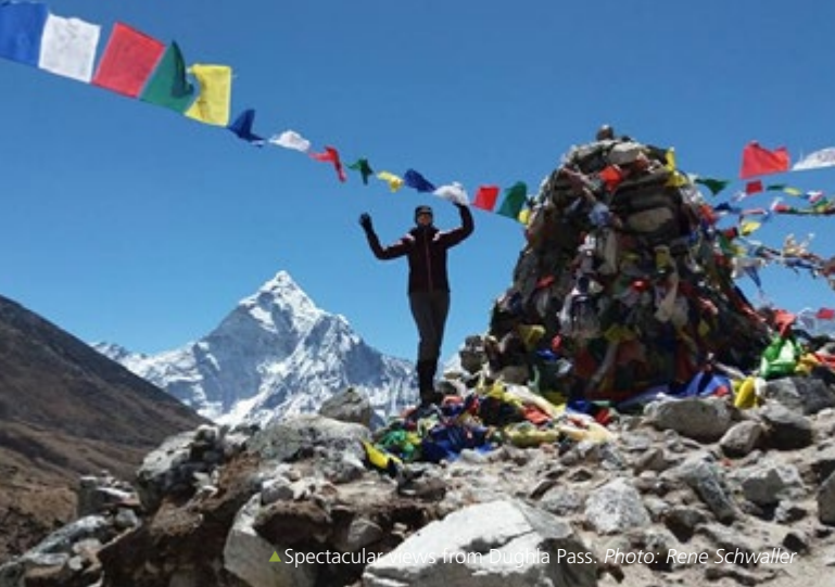
▲ Spectacular views from Duglha Pass.