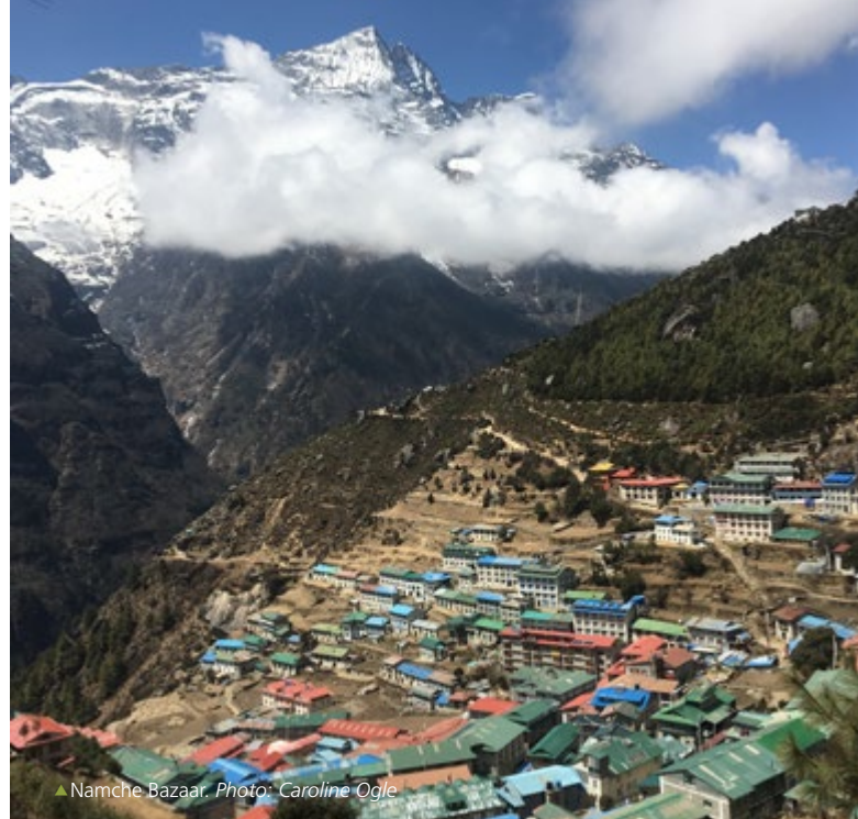
▲ Namche Bazaar.

with most altitude related problems. Experience has shown us that good hydration, rest days at significant elevations and good base fitness help avoid any significant problems during this trek.