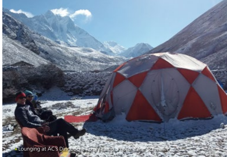
▲ Lounging at AC's Dingboche luxury camp.