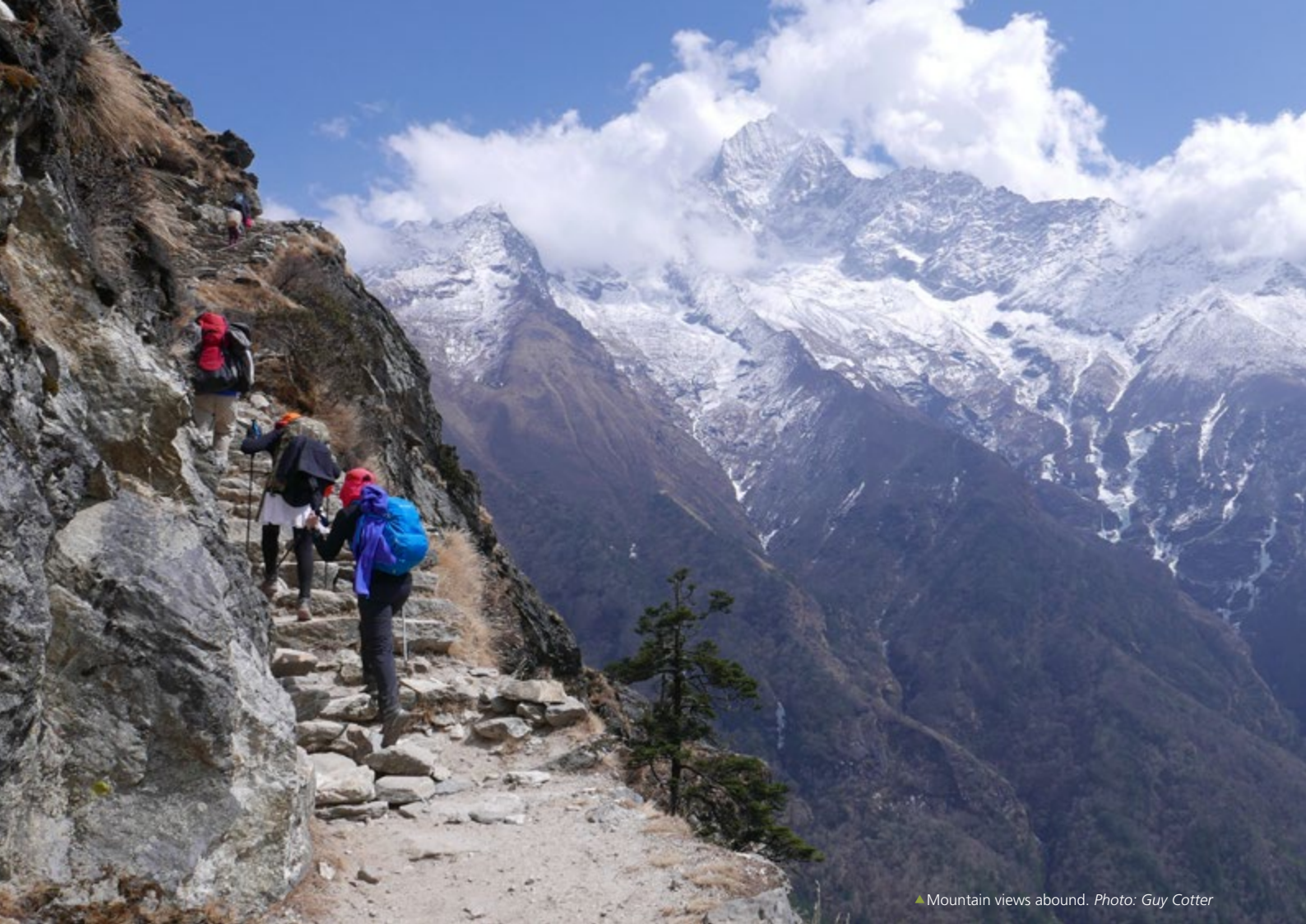
▲ Mountain views abound.