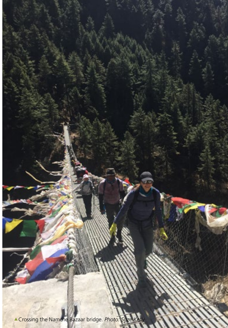
Crossing the Namche Bazaar bridge.

Day 14 Trek to Dingboche or optional add-on flight from Gorak Shep to Kathmandu.