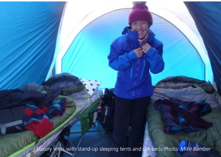
Luxury tents with stand-up sleeping tents and cot-beds