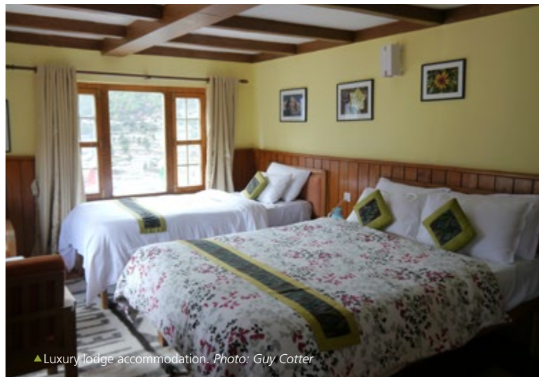
▲ Luxury lodge accommodation.