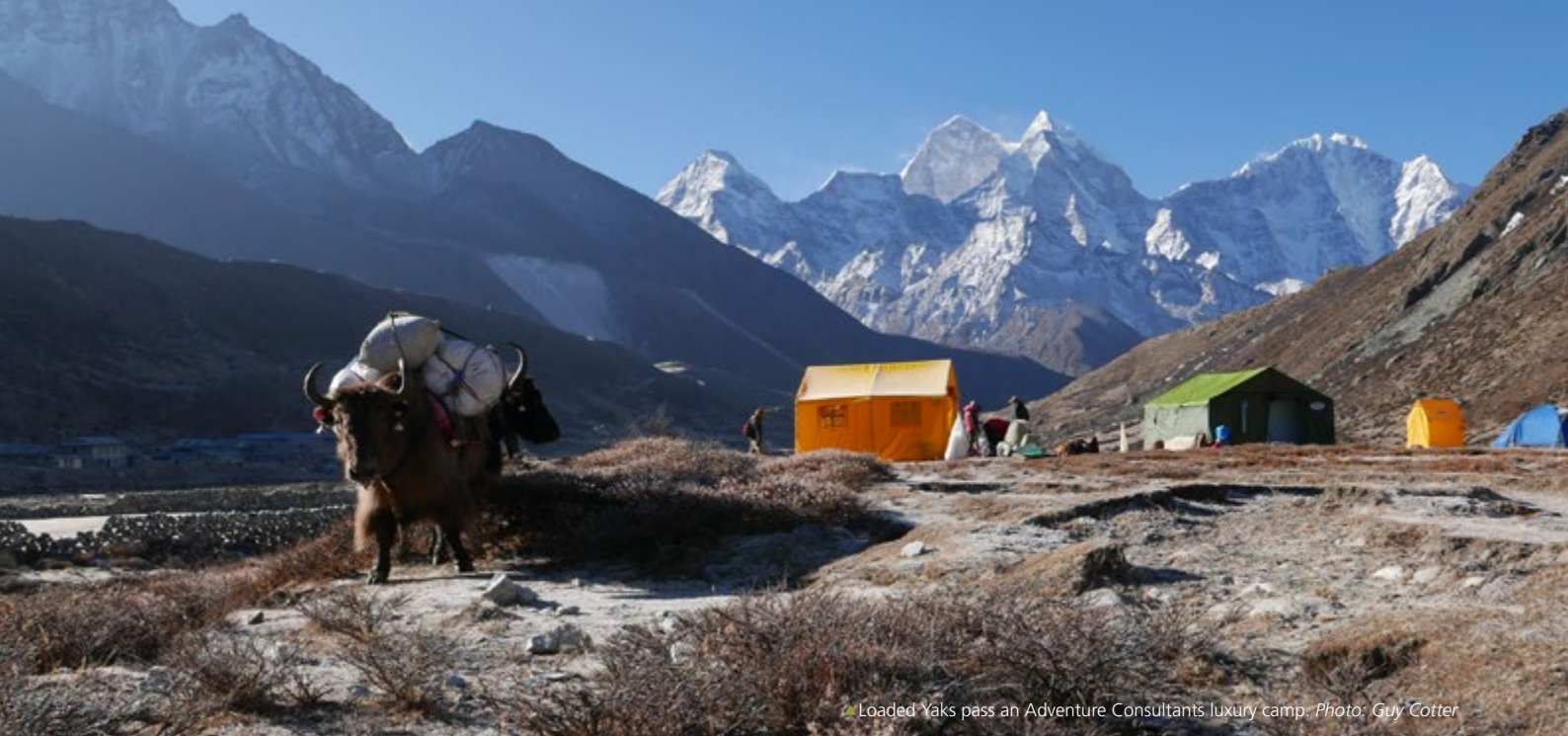
Loaded Yaks pass an Adventure Consultants luxury camp.

At sunrise or sunset, the views of Everest can be magical, and we hope to enjoy a photographic session with you there! After an attempt on Kala Patar, we descend to Dingboche for our final night in the Khumbu before we fly back to Kathmandu by helicopter.